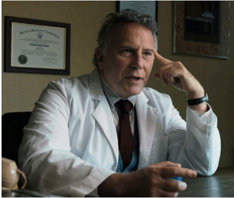
Paul Reiser '73 in Netflix's new season of Stranger Things

Paul Reiser plays Dr. Owens in Netflix's new season of Stranger Things . Paul is best known for the TV series "Mad About You", a NBC sitcom that he co-created, produced and starred in for seven seasons.