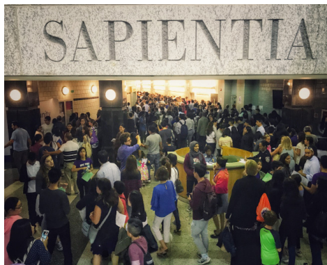
Lobby of Stuyvesant at the Oct 12th Open House

The general Stuyvesant Open House took place on the evenings of October 10th and 11th. School faculty and hundreds of student volunteers worked tirelessly to show off the school to the 5,000+ attendees that visited the school from all five boroughs. Many of the visitors are excited and nervous 8th graders who have taken the SHSAT on Oct 21/Oct 22. We hope we'll be seeing many of them again very soon!